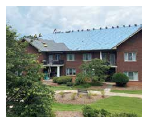
E-Wing (Evergreen) is the first to get a makeover in Foothill's main building roofing project.

Last year, the Foothills Community's main dining room got a new roof, and construction started for a 12-apartment expansion in Independent Living called "Hickory." This year, Hickory is fully occupied. The main building is now getting a new roof (as well as the original independent living and assisted living apartments). Foothills is also adding the amenities of a bistro and pavilion. These will offer residents a new dining venue and gathering place.