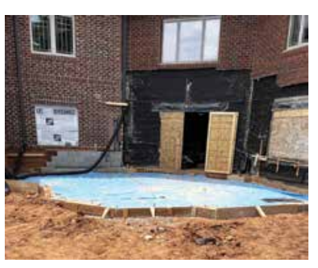
Much is happening behind closed doors as a new dining venue develops! PCSC looks forward to giving Foothills residents an additional dining option with a casual flare.