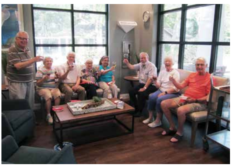
A group of Village residents enjoy a wine tasting with appetizers in The Village Café.