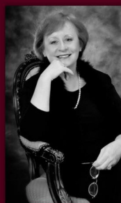
Daphne Simpkins Presentation: "Gene Autry, The Singing Cowboy"