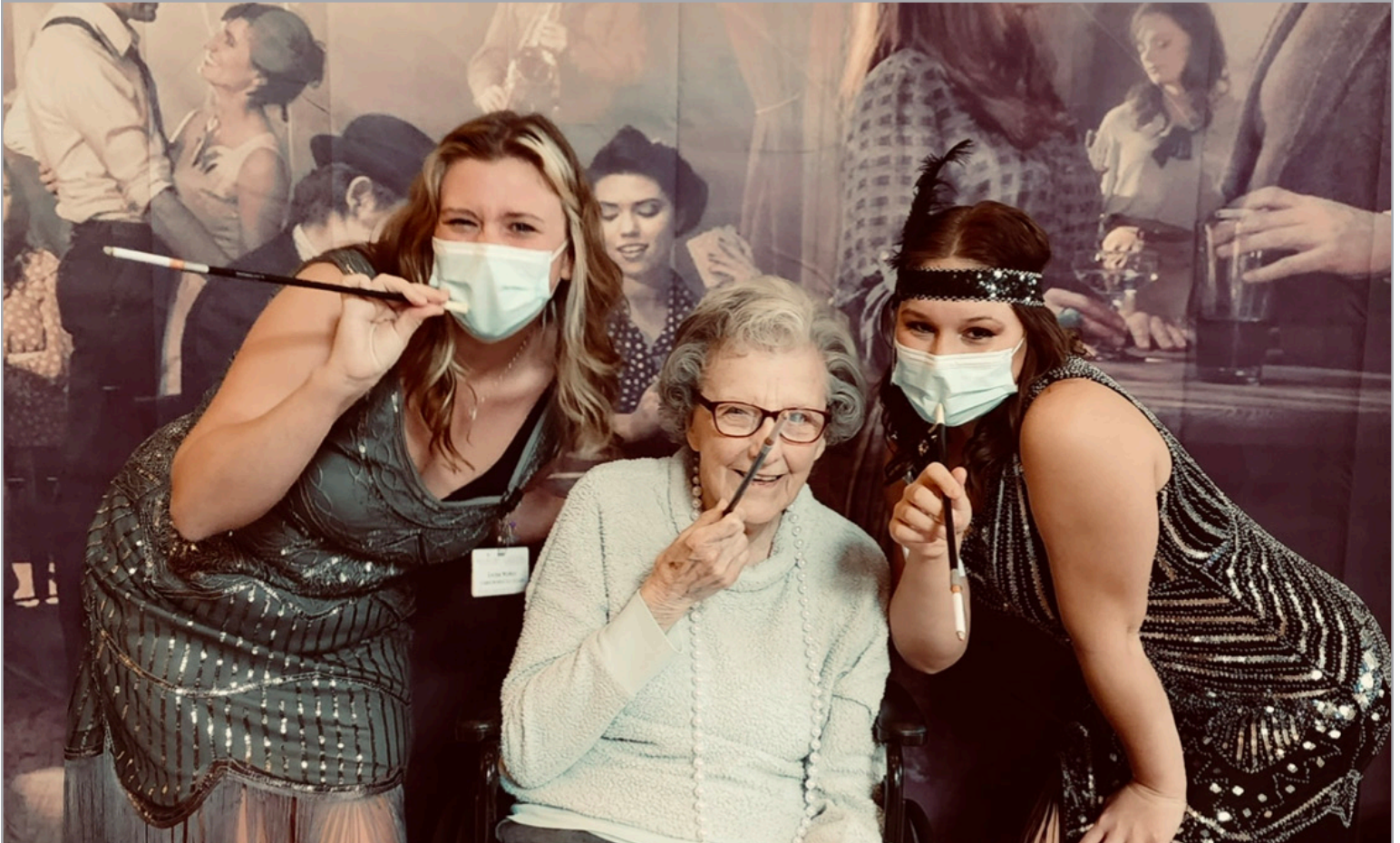
Our Great Gatsby Gala took our residents back into the 1920's. Nothing but smiles and memories made from our flapper dancers to the champagne!