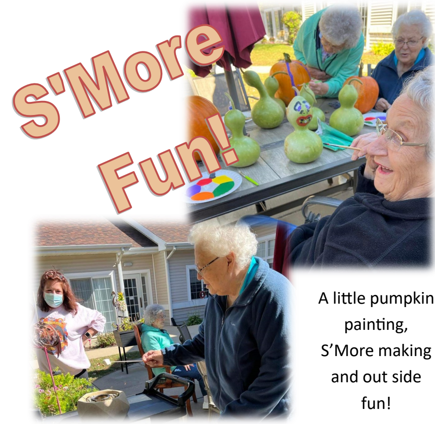
A little pumpkin painting, S'More making and out side fun!