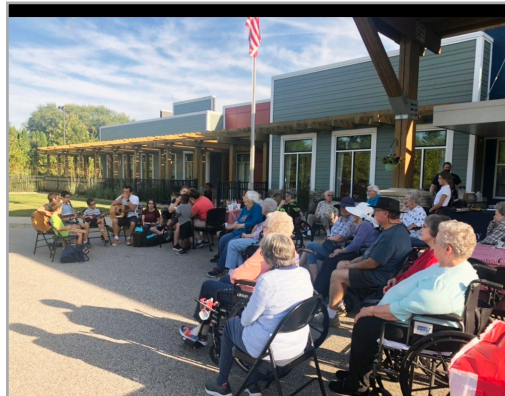
Fall Fun on Legacy Lane!