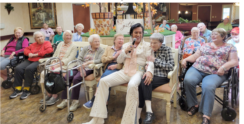
Enjoying the music