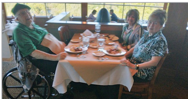
Dinner with the family is priceless!