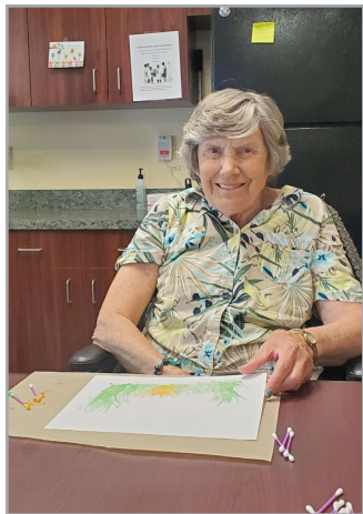
Love what I do!