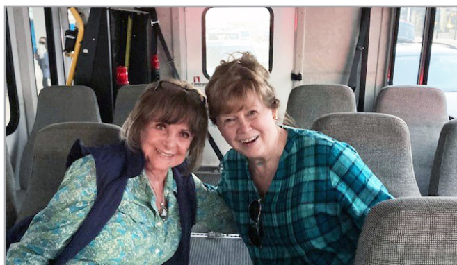
A dream come true.