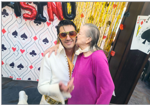
Marilyn and Elvis