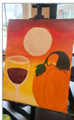
Wine & Canvas