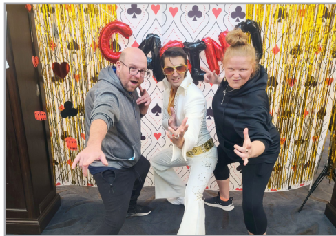
The Elvis Pose