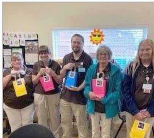
Customer Service Moment: We have the Best Environmental Services Team! They always go above and beyond for our residents. They keep White Oak looking beautiful!