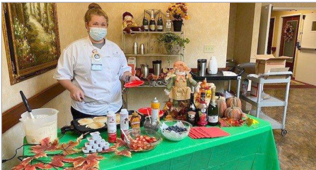
Happy Hour: Our Assistant Director of Food Services showing off some of her mad skills with a Pancake Bar for Happy Hour. It was delicious!