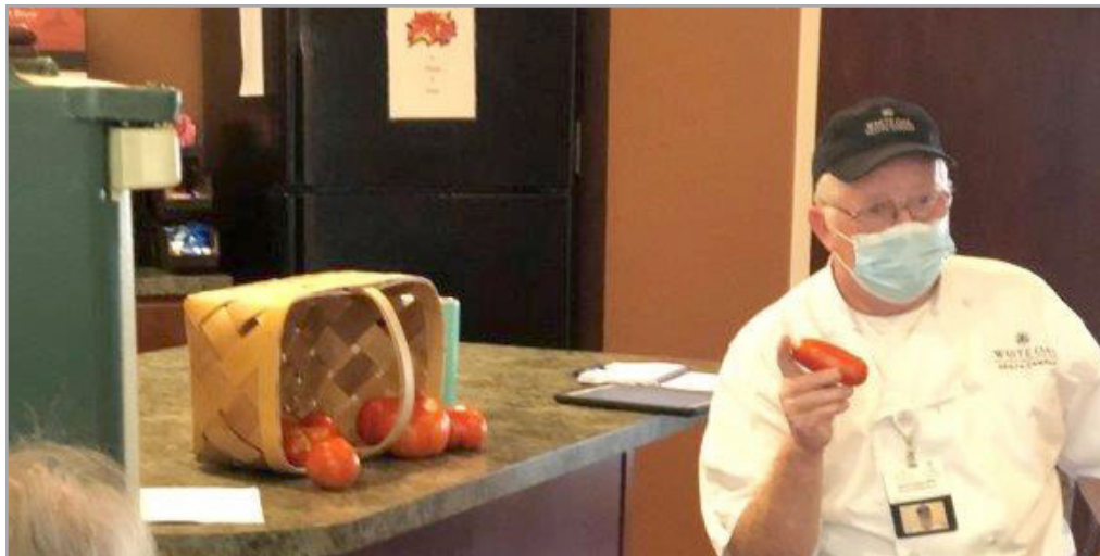
Chef's Corner: There are so many kinds of tomatoes. They can be used for many dishes. I think our favorite way to eat them is to right off the vine. And these are White Oak grown!