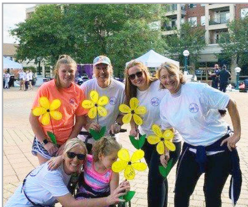
Community Connections: This team from White Oak joined the Walk to End Alzheimer's this year. This one of the best events I have volunteered for. If you want to volunteer for next year's walk give us a call.