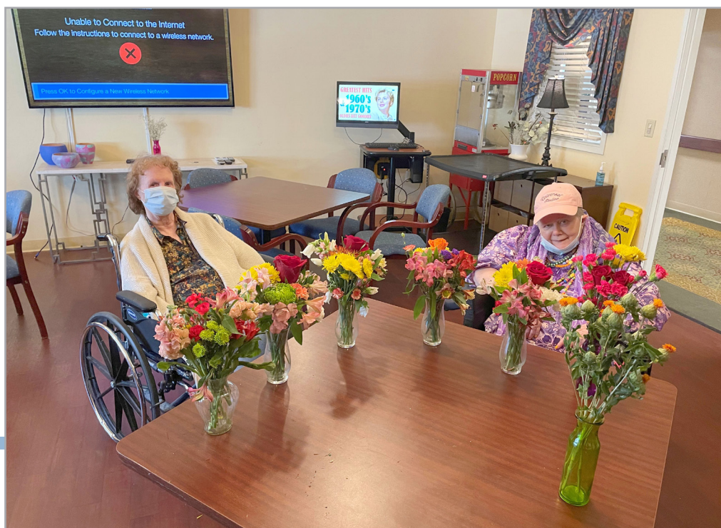
Who doesn't love making a beautiful flower arrangement?

A big THANK YOU to the wonderful volunteers at "The Flower Buds"! They come by every Monday with a large bucket of re-purposed flowers. We then use those flowers to make beautiful bouquets for our community.