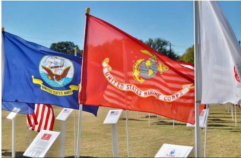
What is the difference between Veterans Day and Memorial Day? Memorial Day, in May, is dedicated to Americans who have served and who passed away during (or as a result of) serving. Veterans Day honors all Veterans, alive and who have passed.

Then, in June of 1926, Congress passed a resolution saying November 11 should be commemorated yearly. As of May 13, 1938, Armistice Day was a legal Federal holiday.