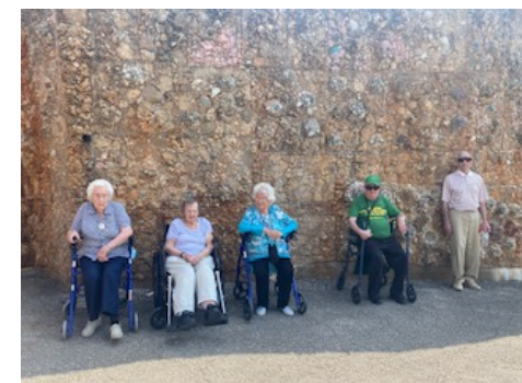
GROTTO ROAD TRIP