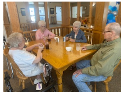
POPCORN BAR for Social Hour