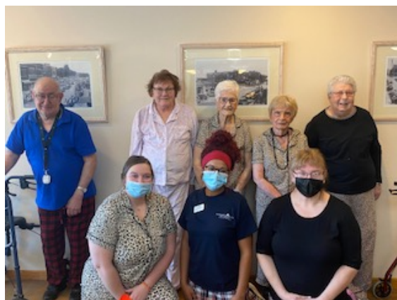
PAJAMA DAY during National Assisted Living Week