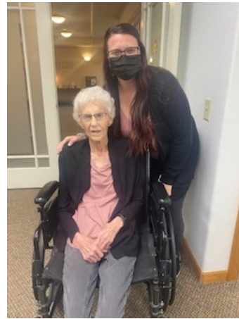
LOOK A LIKE DAY