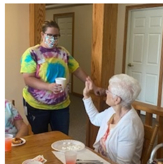
MINUTE TO WIN IT FUN