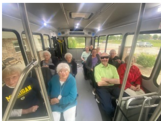
Everyone enjoying a tour of the country!