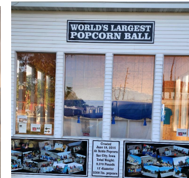
Road Trip to see the World's Largest Popcorn Ball