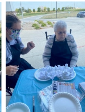
TIE DYING SHIRTS