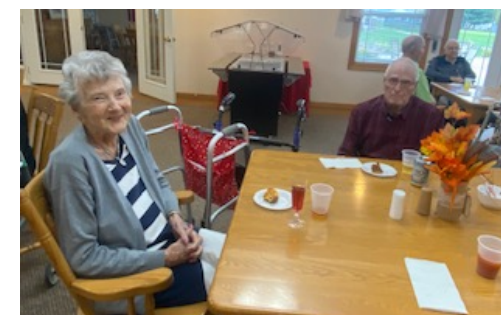
OCTOBERFEST Social Hour