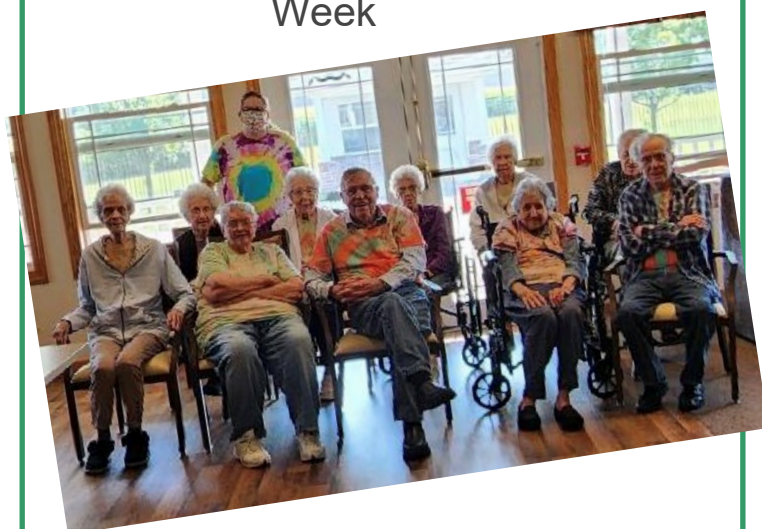
TIE DYE DAY was a hit!