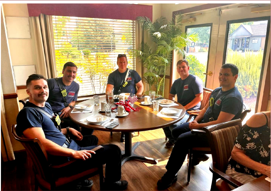
Bottom: Our Jacksonville Fire Team during our 9/11 Honor Lunch