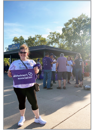
Walk to End Alzheimers 2022