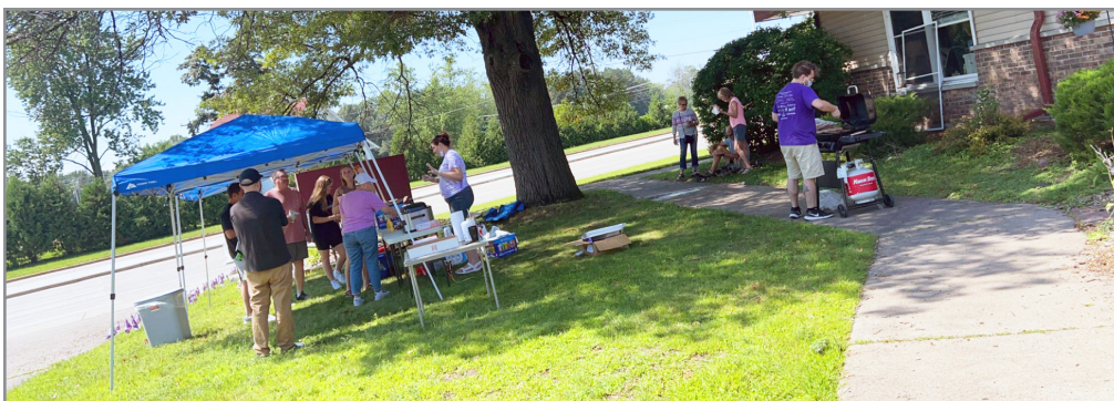
Our brat fry 2022 was a success