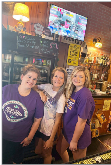
We bartended at O'Briens on Main, for the Walk to End Alzheimers!