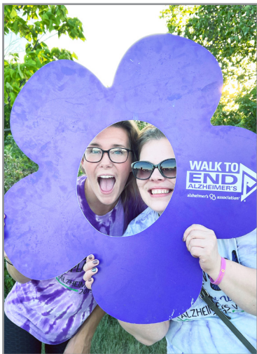
We attended a brewer game on behalf of the Portage County Alzheimers Committee