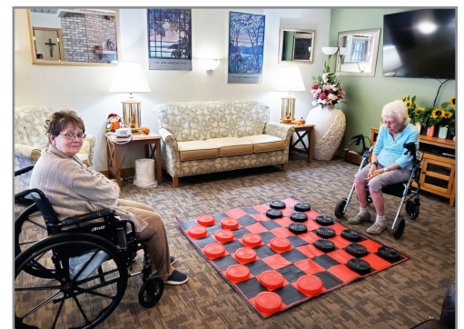
A quick little game of checkers