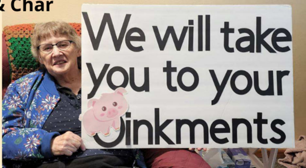
With our awesome parade signs