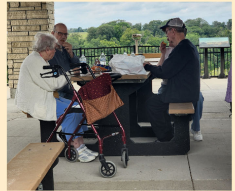
Picnic at Pine Lake