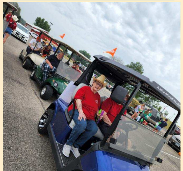
So much Fun!