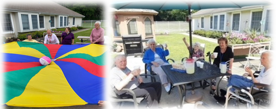
Summer Courtyard Fun!