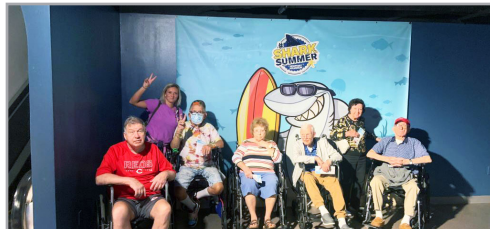
The Residents at Newport Aquarium