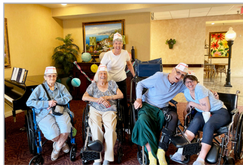
Ready for Happy Hour

Then Thursday afternoon Legacy will be going on their Country Cruises. Register for Outings at the Life Enrichment Office no later than the day before the outing. Weather conditions may postpone outings.