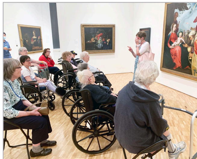
Legacy BFFs at the Eskenazi Museum