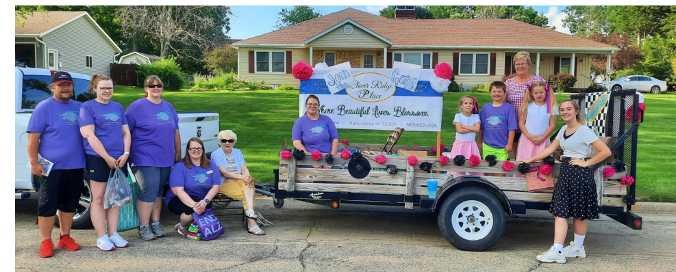
2022 Jackson County fair parade float, with part of the crew.