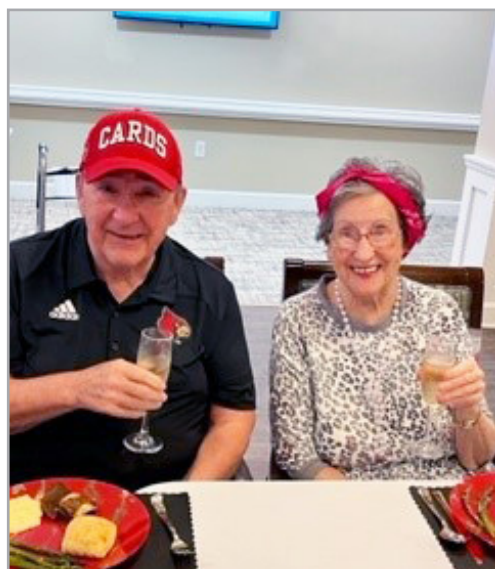
I Love Lucy Dinner