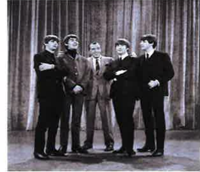
1966 Beatles' "Paperback Writer" single #1 & stays #1 for 2 weeks