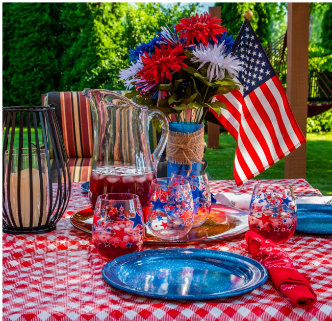
The more, the merrier! Taking part in a holiday event can be a fun, easy way to naturally engage with others.