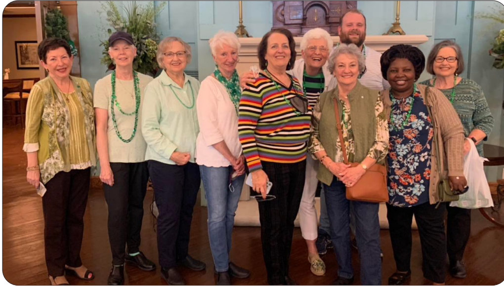
Special thanks to Christ Church UMC for a beautiful St. Patrick's Day Party, as they sponsored the March birthdays at Fair Haven (Birmingham).