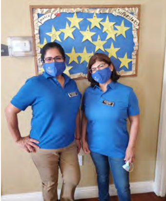
Wearing Blue in support of World Autism Awareness Day