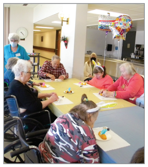
Resident making their own edible Easter craft.

Thank you to our local 5th grade class for taking the time to show off their talents on their poster boards, dancing and waving at our Residents.