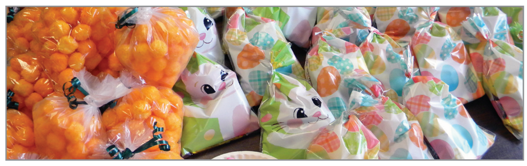
Easter treats for all of our Residents