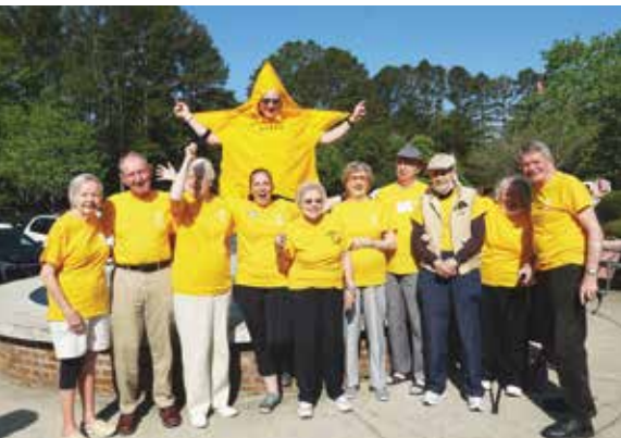
The Columbia Community had real STAR power!