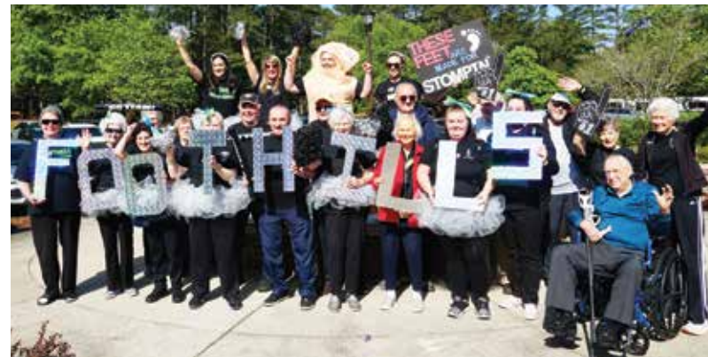
Congratulations to the Foothills Community on winning the 2022 Spirit Award for best team spirit.