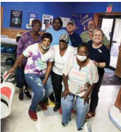
The housekeeping and maintenance team spends an evening bowling.