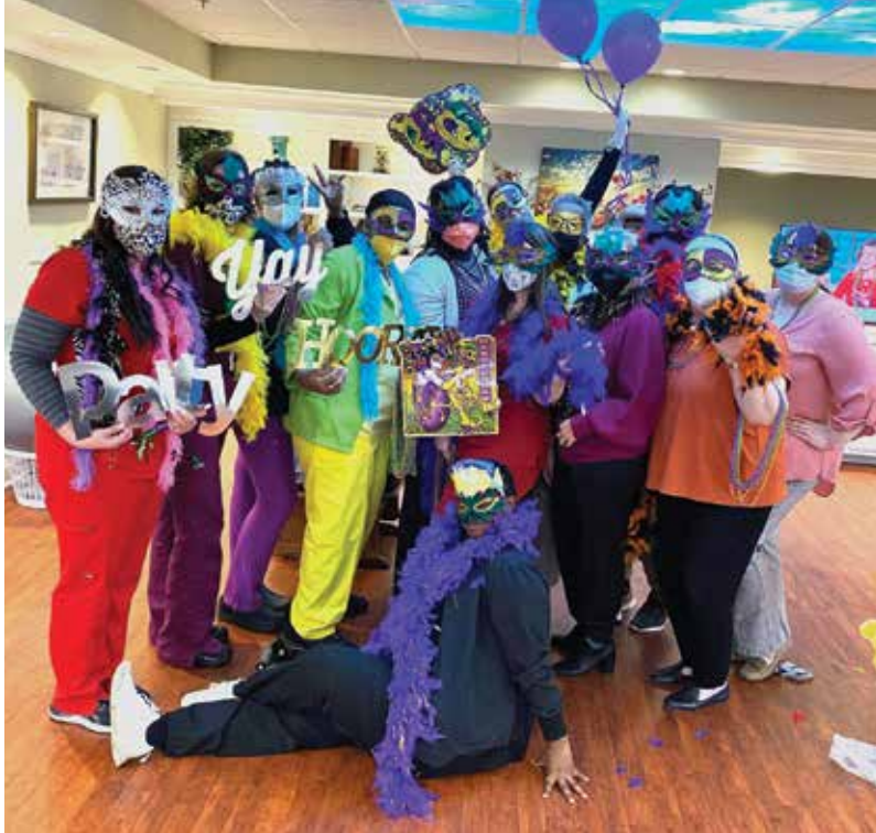
It's Time to get Jazzy! Florence Team prepares for the first annual Mardi Gras Parade in our Skilled Nursing Center.