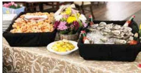
The Easter buffet