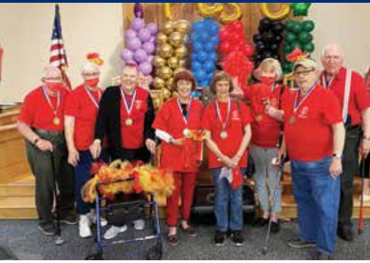
The Clinton Community's medal winners.