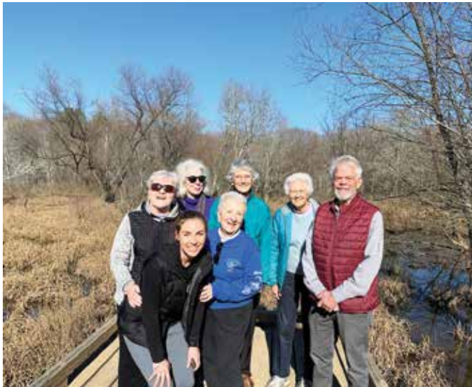
What better way to enjoy a sunny day than to go on a hike at the Rocky River Nature Park in Anderson with our Wellness Director.