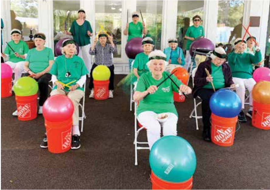
The Village at Summerville held a Pep Rally each Friday leading up to the opening ceremonies of the 2022 PCSC Senior Olympic Games, including a drum line with the ladies wearing bandanas. It was a fabulously fun event.