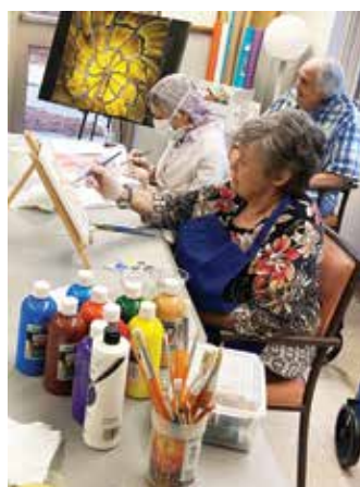
Foothills residents enjoyed tapping into their creative side at our Expressions of Emotions Paint and Pour class.