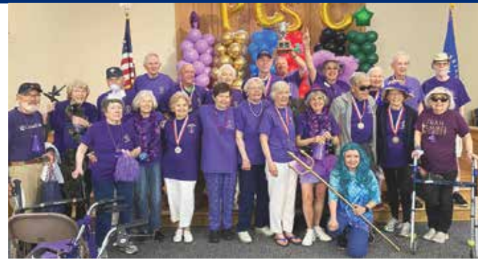
Laurel Crest, winners of the Overall Trophy.