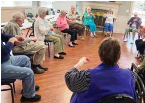
Left: Summer is coming! Residents gather daily to spend time exercising together.