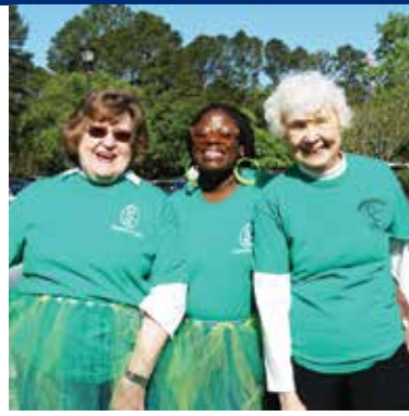
Cheerleaders for The Village!