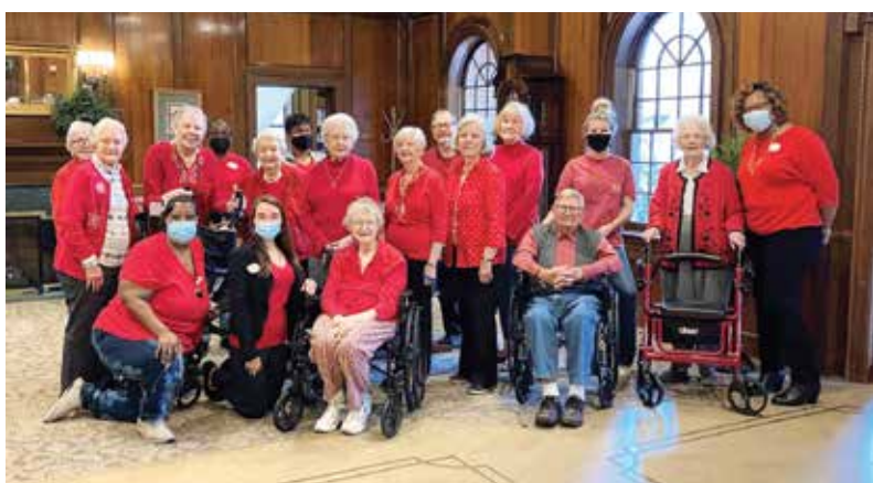
Residents and staff at the Clinton Community celebrated National Wear Red Day.