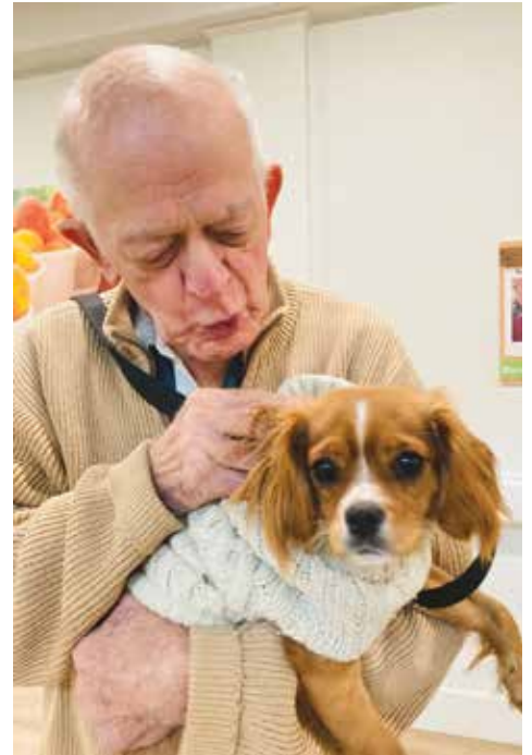
Charles Dutton gives Fifi a little extra love.