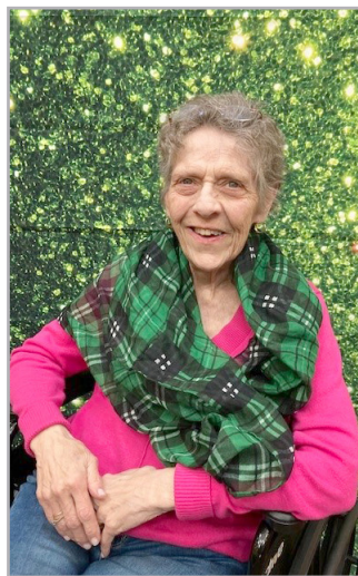
Kitty is up to shenanigans.