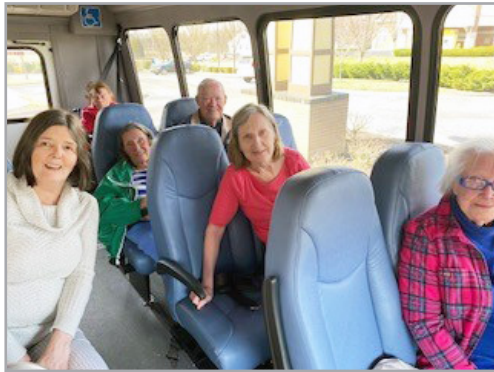
On the Legacy Bus

I remember when I was a teenager in Morehead Kentucky. There wasn't much to do on a Sunday sometimes so my dad would announce "I'm feeling cabin fever let's take a drive". Being a teenager, I usually had a smart comment like "Why? Were not going anywhere". But eventually I found myself surrendering. We would hop in the car and drive all over eastern Kentucky. Looking out the window was a quiet act. We went down windy roads, up steep hills, pass farms with horses, and rolling fields. I was reminded of those times when I took some of our residents for a scenic drive in the Parklands and Long Run Lake. The residents have had quite a bit of cabin fever because of Covid. So, are residents did just what my dad did when he felt bored and stagnant. We went for a drive. The quiet of the bus as we looked at the beauty of the Middletown sights was just what everyone needed. "Oh, look at how beautiful everything is" was a comment I heard. "Can you believe those trees?", "That house is amazing", "The water is so nice". Little did I know when I was a teenager my dad was reminding me of the beauty we are surrounded by. And so, there will be more drives where we are not really going anywhere. Sometimes it's just what you need.