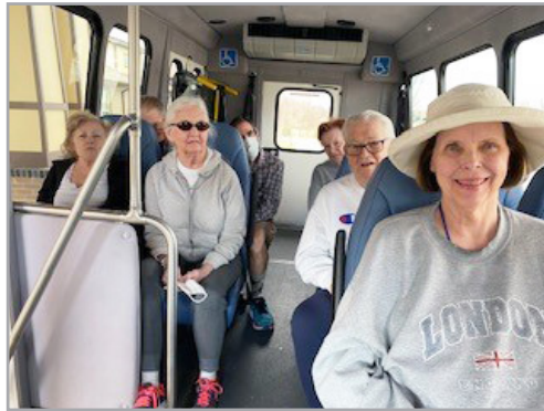
Legacy Scenic viewers