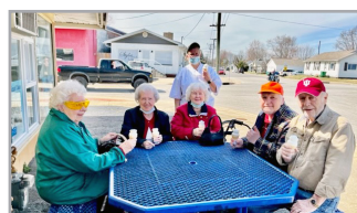
Residents enjoyed free ice cream cones from Dairy Queen, on National Free Ice Cream Day.