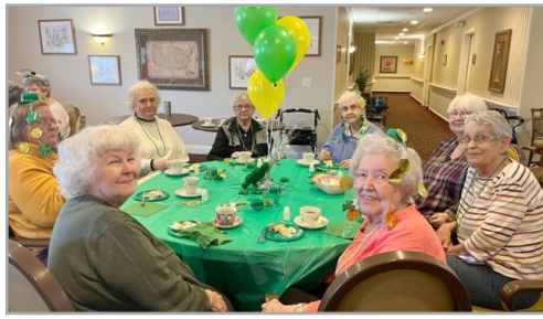
Our St. Patrick's Day Tea Party was a success.