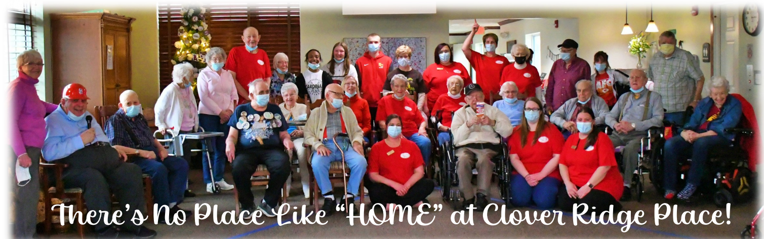
There's No Place Like "HOME" at Clover Ridge Place!

Team Clover Ridge Place celebrated National Baseball day with a League of Our Own!