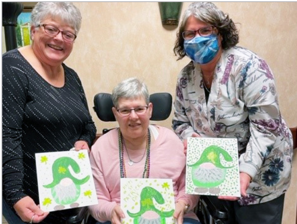
Crystal and Crystal's Sisters displaying their paintings