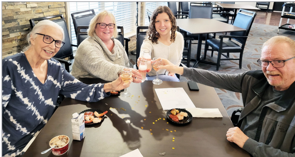
Happy Hour on Fridays is always a fan favorite!

Please join us for Happy Hour every Friday from 3pm-4pm. Plan to have some delicious food and beverages but even better company!