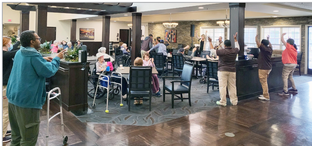
Happy Hour is more fun with friends!