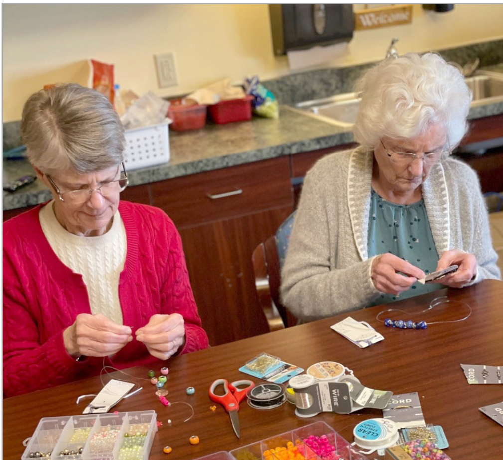
We spent time crafting some beautiful jewelry