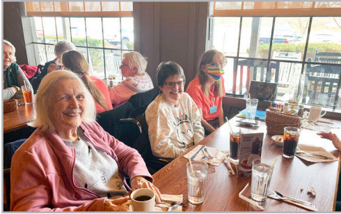
The group out to Cracker Barrel