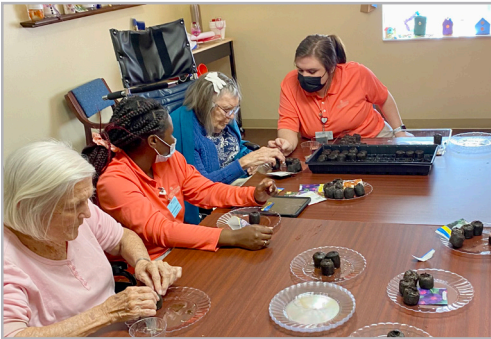
Campus in Color Gardening