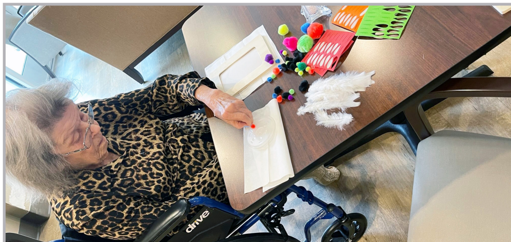
Legacy Daily Rhythms