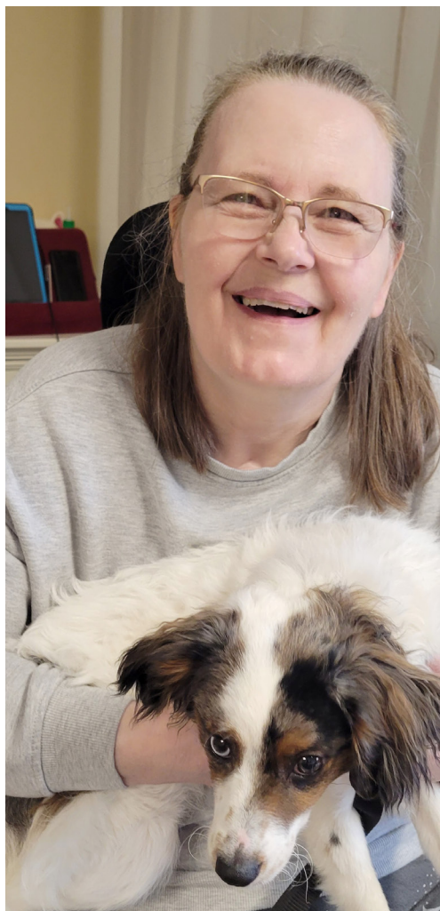
We recently enjoyed National Puppy Day with this sweet 8 month old fur baby named Barkley