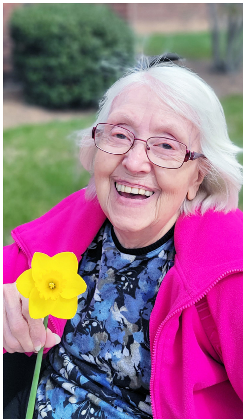
Enjoying the Spring Air!