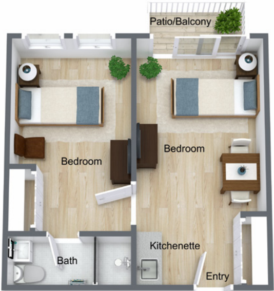
DEL MAR (SHARED)