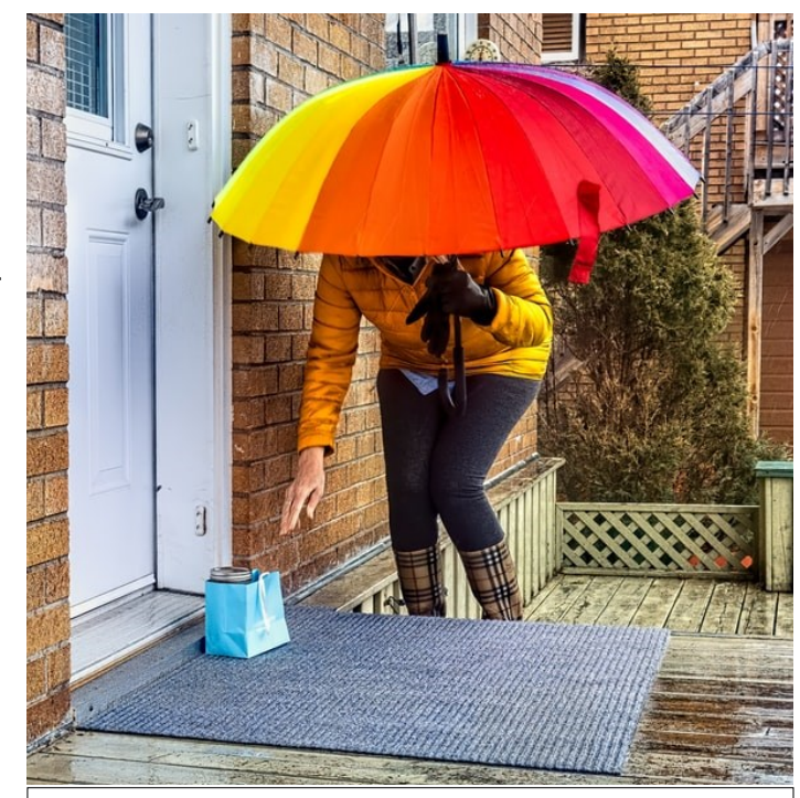
Ring Ring! Let the doorbell signal to supplies on the front step for one in need. Giving to others is also giving to yourself! Those who volunteer may experience mental health benefits and an increased sense of belonging in the greater community.