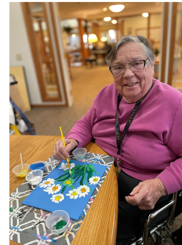
Ganelda painting a spring bouquet to summon the warmer weather!