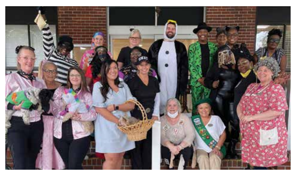
The Florence team celebrates Halloween 2021!