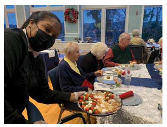
Hors d'oevres were followed by pasta, wings, mashed potatoes and prime rib bars, then a choice of luscious desserts.