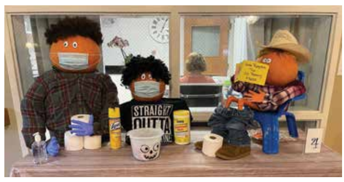
Pumpkin Decorating Contest winner