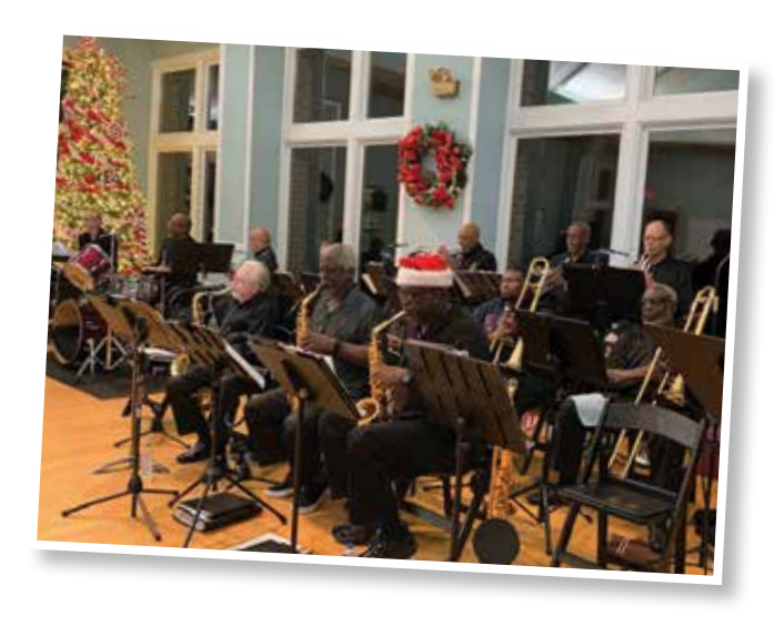
Many thanks to the Carl Payne Big Band for a booming Big Band Christmas show followed by spectacular refreshments, mousse cups and brownies served by our culinary department.