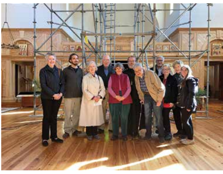
The Sacred Spaces trip to St. John of the Ladder Orthodox Church in Greenville.