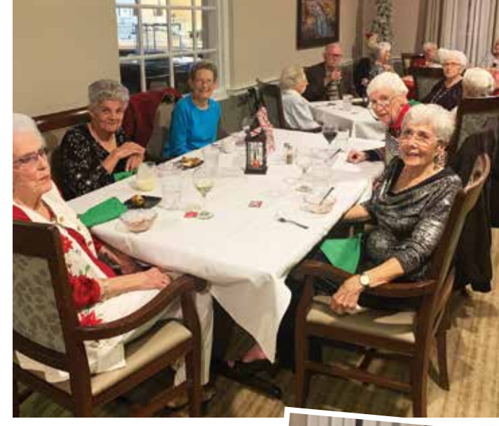
Above and Right: Florence residents enjoy a night in for their annual Christmas Party.

Left: The Florence Leadership team kicks off the resident Christmas Party 2021 by serving hors d'oeuvres.