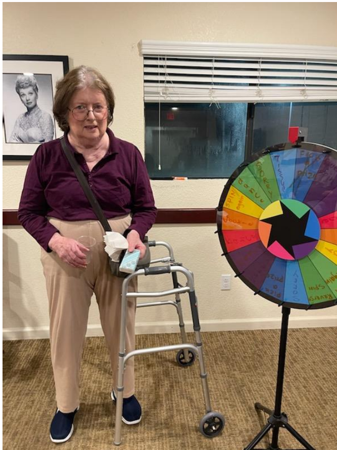
Spinning the Wheel & wining a prize.