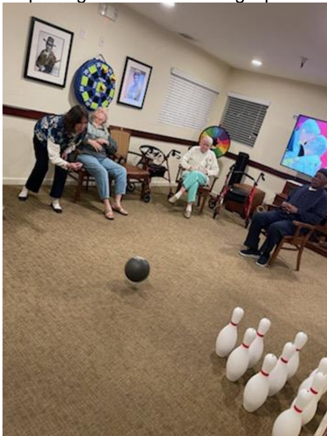
Bowling for a Strike.