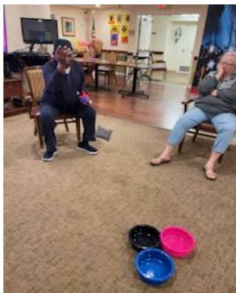
Tossing the bean bag in the bowl.

All the staff working with our Reflections residents are doing a magnificent job supporting all the residents in participating in various types of activities. Whether it be playing games, doing art in various forms or exercising, everyone is doing their part.