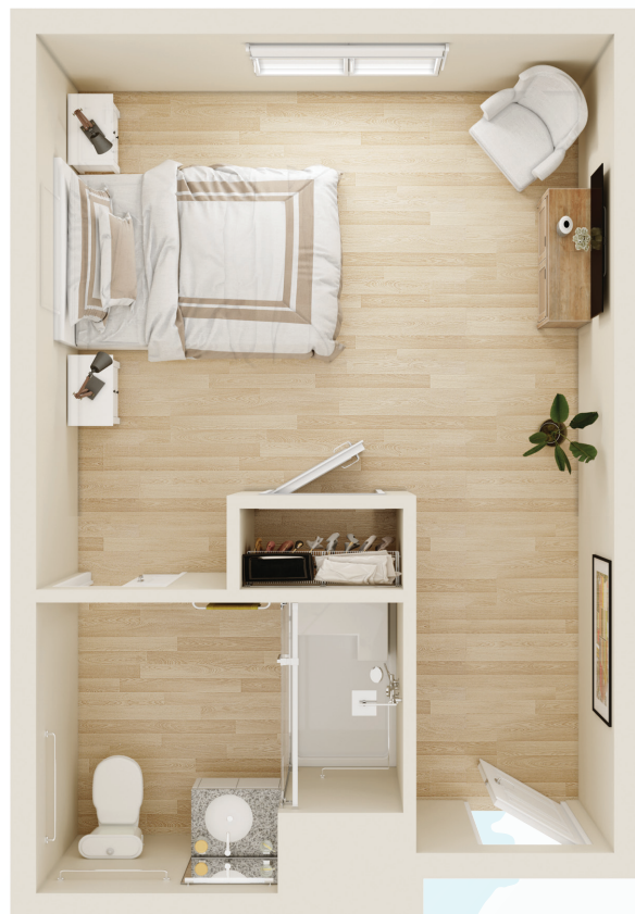
STUDIO 349-359 Sq. Ft. Studio / 1 Bath