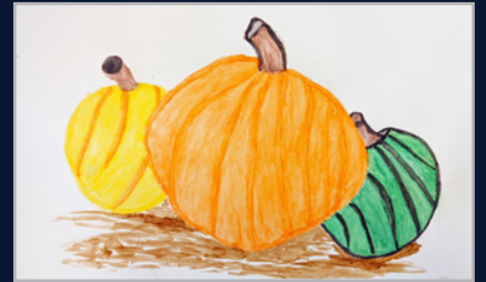
Patty's attention to detail blew us away!