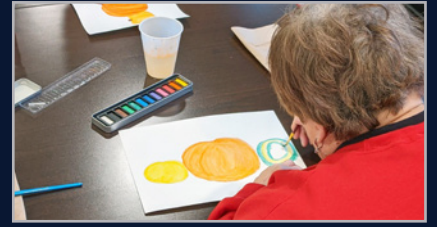
Graci hard at work on a new skill, watercolors.

Residents are letting those creative juices flow!