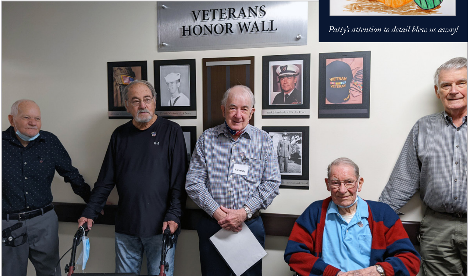
It was a pleasure to honor our veterans and unveil our Veteran's Honor Wall.