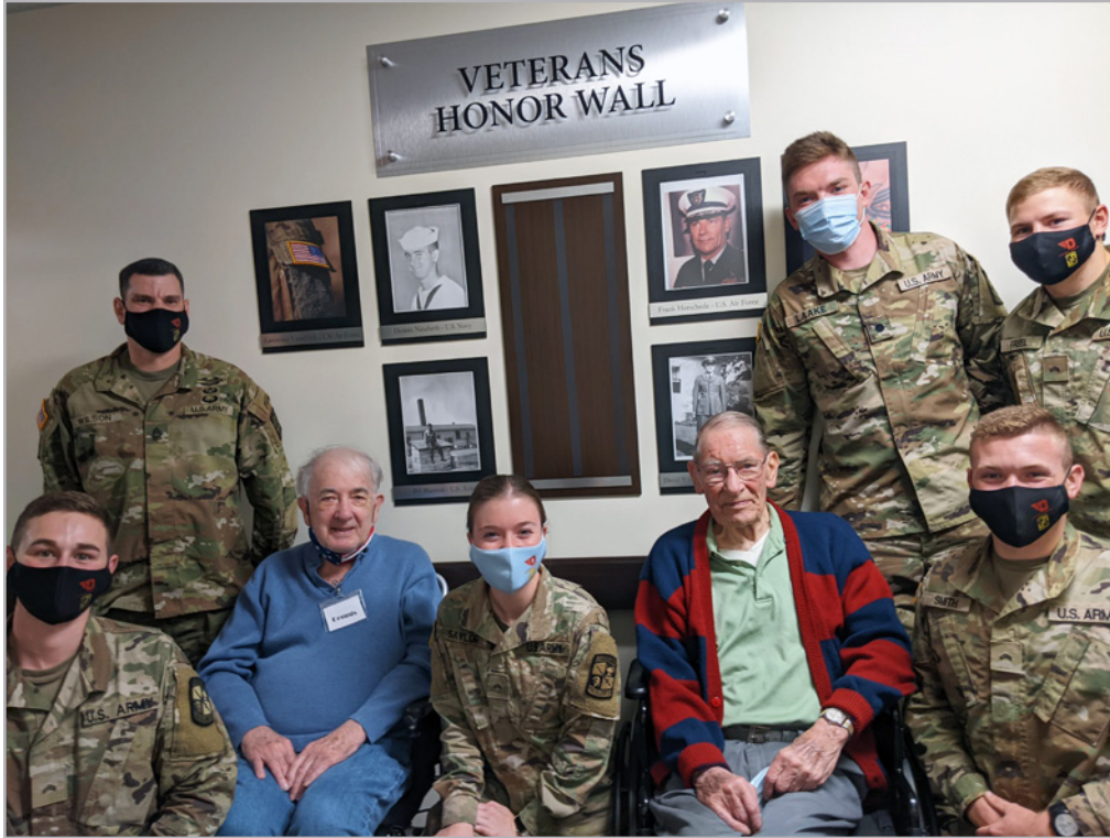
Thank you to UD ROTC for visiting with our veterans!

We were honored to host some of UD's ROTC Cadets for a social with our residents in recognition of Veteran's Day