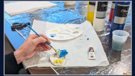
Wishes for Spring are in the air.