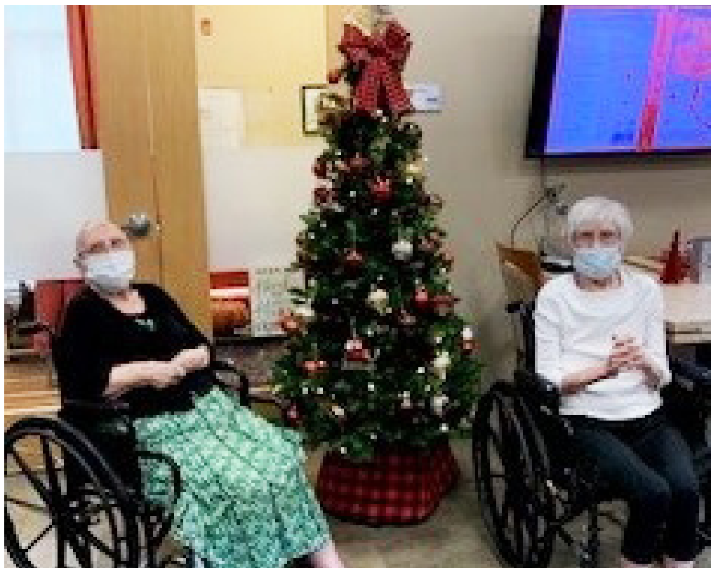
Friends enjoying some fun around the tree