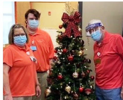
The tree decorating group.