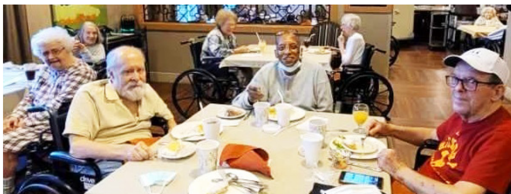
Residents enjoying dinner.