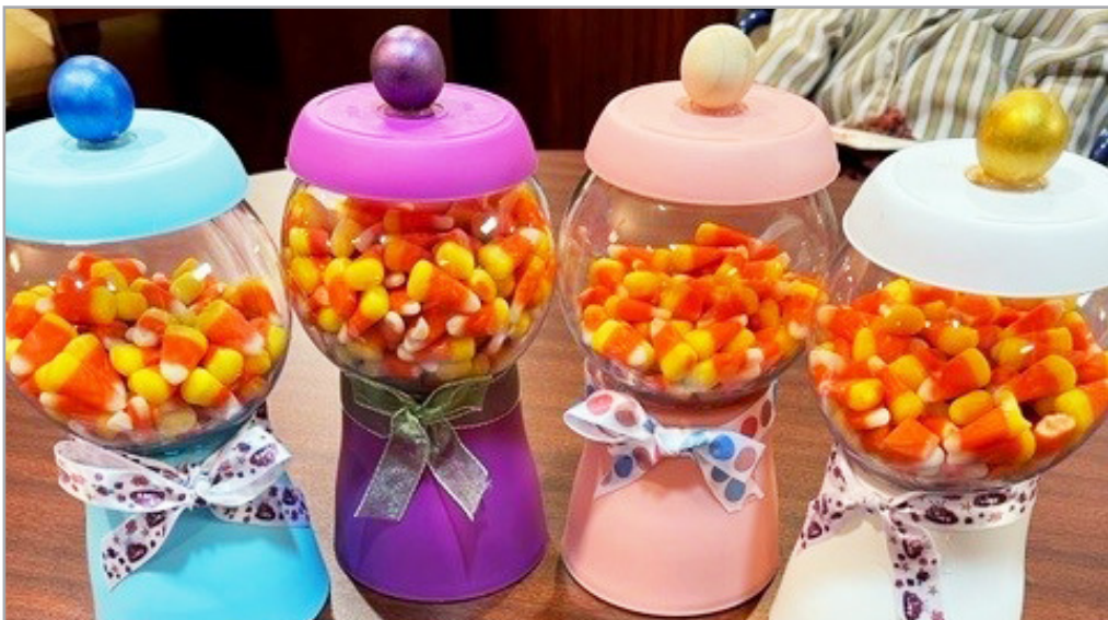
Candy Corn Old Fashion Candy Machines.