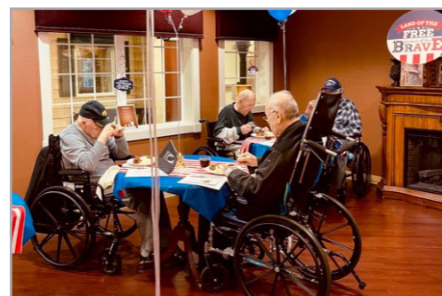
Residents having a special Veterans lunch.