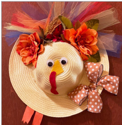
Turkey Straw Hats made for residents doors.