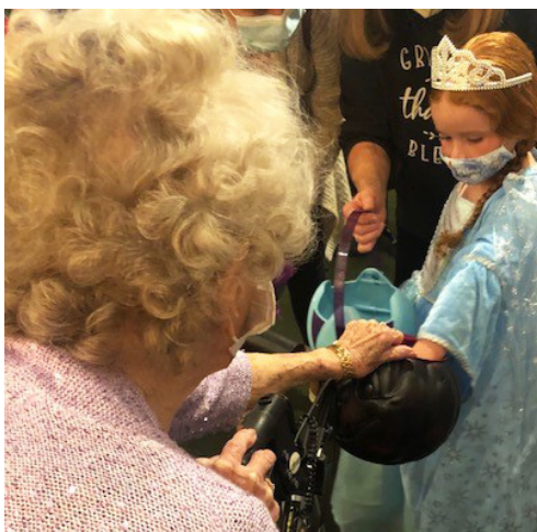
Residents loved handing out candy to our little Trick or Treaters.