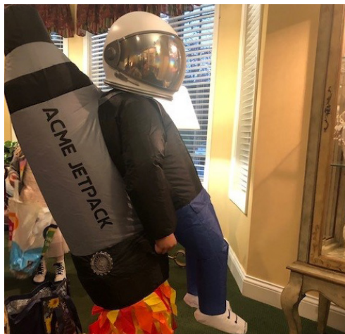
An astronaut was present during our Trunk or Treat Event.