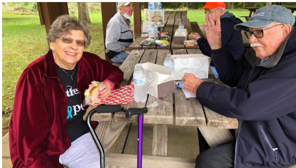
Residents are enjoying their annual picnic at Westwood Park in Henry County.

We visited Westwood Park and participated in our annual picnic. The residents enjoyed the scenery and watched as the autumn leaves began to fall. We also mushroom hunted and found many types of colorful fungus.