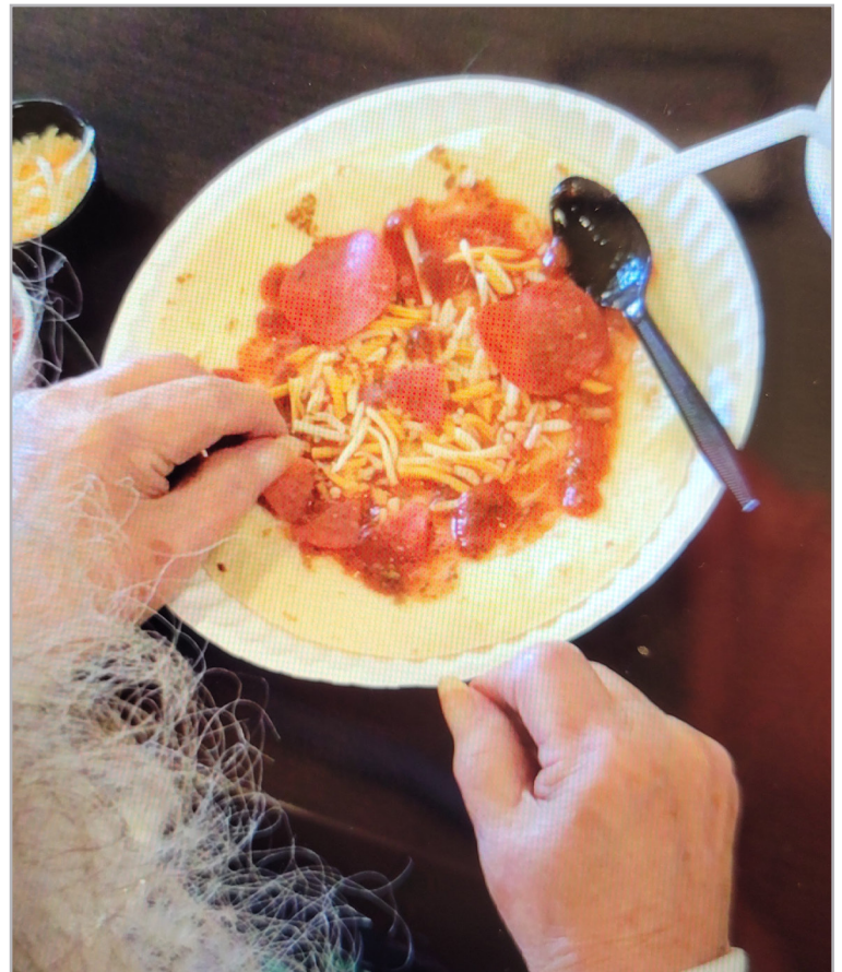
We made our own pizza pumpkins!