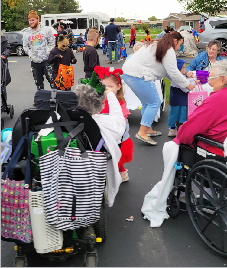
The residents were eager to see all the little ones come through

We were able to make fun memories with our residents by partnering with local companies and hosting a Trunk or Treat!