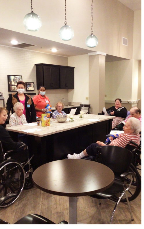
Creative cooking is a highlight of the week!