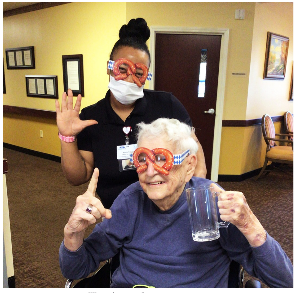
We used a stein for morning exercises.