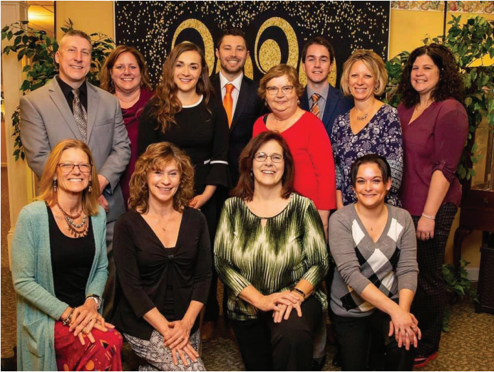
The Chestnut Knoll / Fox Optimal living Leadership Team!

“Our approach to senior care is developing thoughtful, compassionate, and personal interactions. We’ve dedicated our careers to serving seniors, so our bond is deeper than a typical patient-caregiver relationship—we are neighbors helping neighbors,” said Barndt.