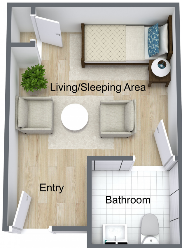
THE PALMS Private Studio