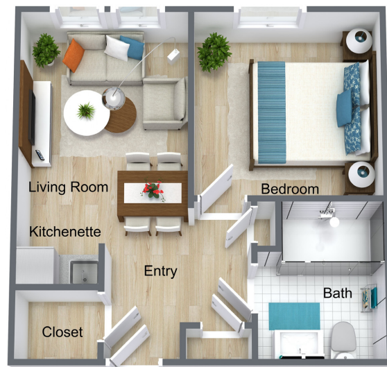
THE WHITE OAK One Bedroom