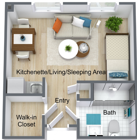
THE ROSE STUDIO