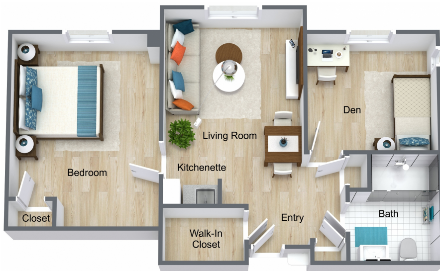
THE BIRD OF PARADISE Two Bedroom